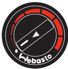
Heater Control Dial