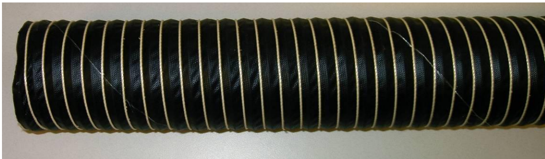
Air duct used in Volvo factory installed heaters. (Standard Webasto ducting can be used)