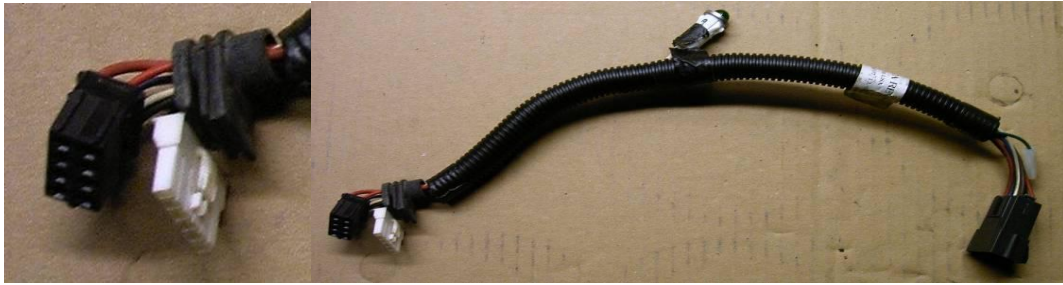
Air Top 2000 S Harness

The harnesses are physically different; this must be replaced as well if changing from an Air Top 2000 S to an ST model. (New harness included with the ST model Kit P/N 5001499A).