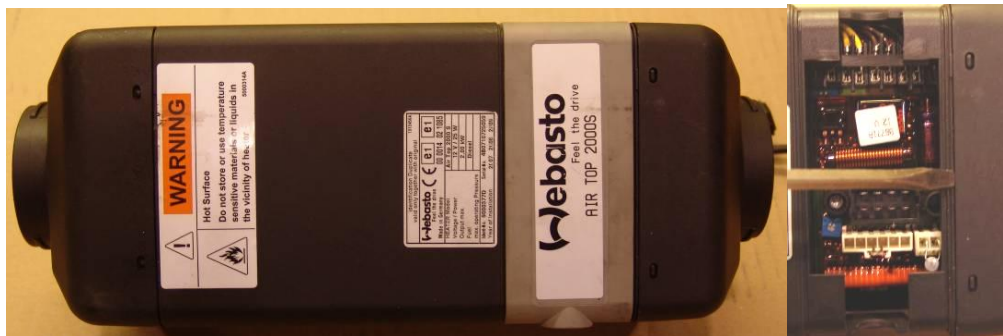
Air Top 2000 S

NOTE: If you have an Air Top 2000 S factory installed heater and the heater has failed and CANNOT be repaired, replace the unit with Webasto P/N 5001499A . This includes the Air Top 2000 ST heater, harness, and a label.